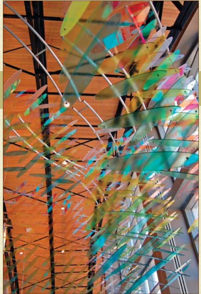
Shimmering Echoes by Koryn Rolstad

Leading by example, the City of Suwanee set aside one percent of construction costs of the new City Hall for public art. (It's important to note that these funds were part of capital project monies and not the City's general operating budget.) In turn, Suwanee encourages developers to commit one percent of their new projects' cost to fund public art on their property or support public art in other locations throughout the community.