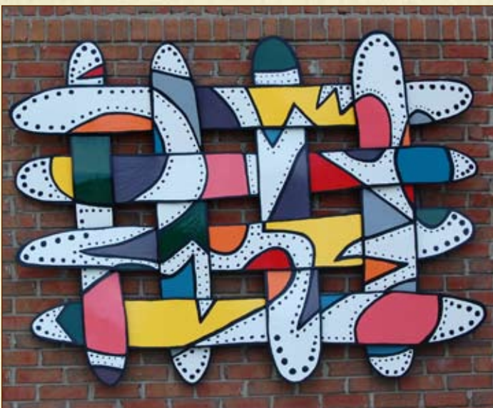
Dreams of Flying by Harry Zmijewski

More than 350 public arts programs operate across the United States, The best programs – and public artworks – are those built on the foundation of proactive partnerships. A successful public art program in Suwanee will require the support and leadership of businesses like yours.