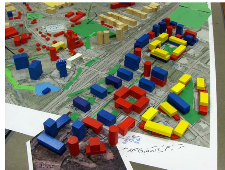
Looking at the I-85 interchange