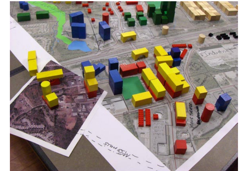
Looking at the I-85 interchange